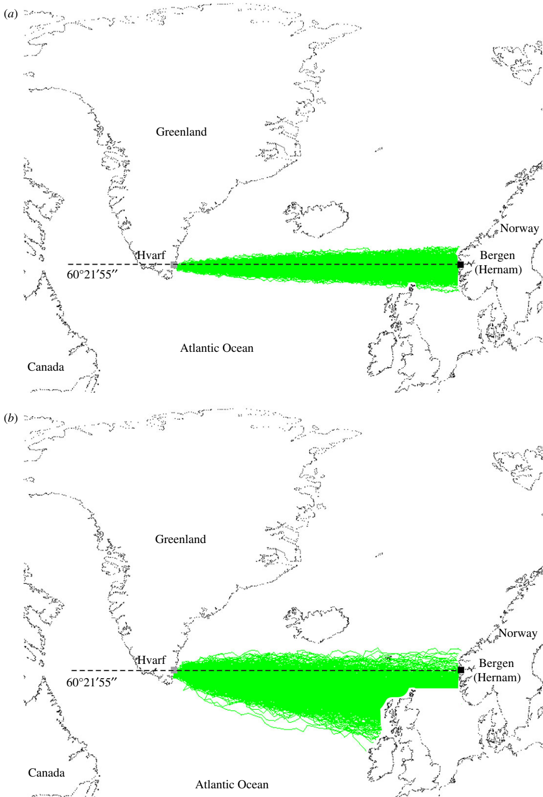
Figure 3. Simulated Viking sailing routes from Greenland to Norway. Simulated (successful: green) routes of 1000 Viking voyages from Hvarf (Greenland) to Norway at spring equinox, if a calcite sunstone crystal is used to analyse sky polarization with a navigation periodicity (a) \Delta t = 1 h, and (b) \Delta t = 6 h.

Figure 3 shows 1000 simulated Viking sailing routes from Hvarf (Greenland) to Norway at spring equinox if a calcite sunstone crystal is used to analyse sky polarization with a navigation periodicity \Delta t = 1 and 6 h. All these voyages are successful, because they terminate somewhere on the coasts of Europe.