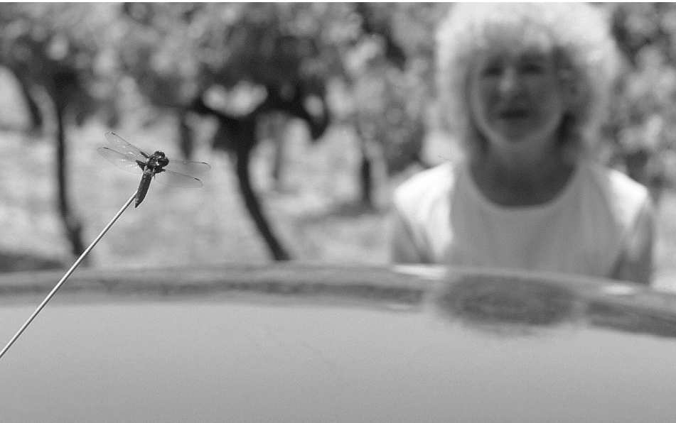
Figure 1: Territorial male of Libellula depressa perched on the tip of the radio antenna of a dark-green car parked by a vineyard. The body axis is held parallel to the steeply incident sun rays, thus minimising heating of the body. The real colour of the car roof is not visible because the sky and the nearby surroundings are mirrored at the shiny surface.

The reflection-polarization patterns of the car (Figs 2-4) were measured on 25 June 1999 in Rüti, Switzerland (47°16'N, 08°52'E) at 09:30 h solar time on a sunny day, under a clear sky, by videopolarimetry in the red (R), green (G) and blue (B) part of the spectrum at \lambda_B = 450 \pm 40 nm (wavelength of maximal sensitivity \pm half bandwidth of the camera's CCD sensors), \lambda_G = 550 \pm 40 nm and \lambda_R = 650 \pm 40 nm. The viewing angle of the videopolarimeter was horizontal. The method of videopolarimetry is described in detail by Horváth & Varjú (1997).