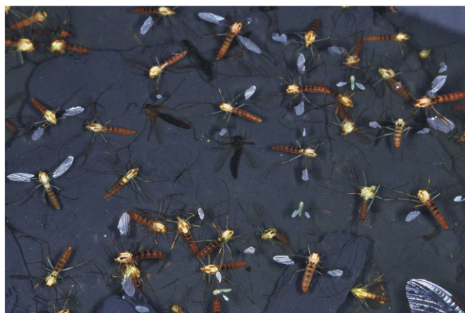
Fig. 3. Photograph of chironomid specimens (Table 1) trapped by the black salad-oil-filled tray used in our choice experiments.